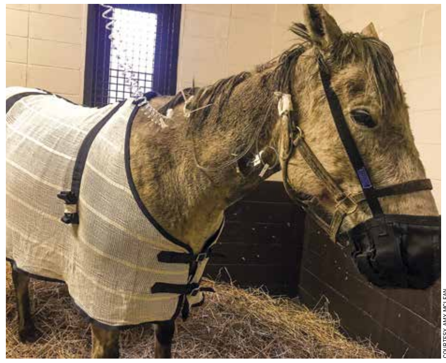
A colic case can require hospitalization and surgery if pain cannot be controlled, if there is indication of gastrointestinal compromise, or if all other treatment options have failed.

So, how can you gauge the severity of a horse's diarrhea? "It is of utmost importance to consider the systemic health of the horse in question," Browne says. "Mild diarrhea caused by feed changes is typically transient (one to three days at the most) and not generally accompanied